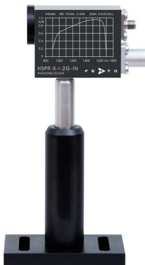
The picture shows the HSPR-X-I-2G-IN-FS with free space input. The photoreceiver will be delivered without post holder and post.